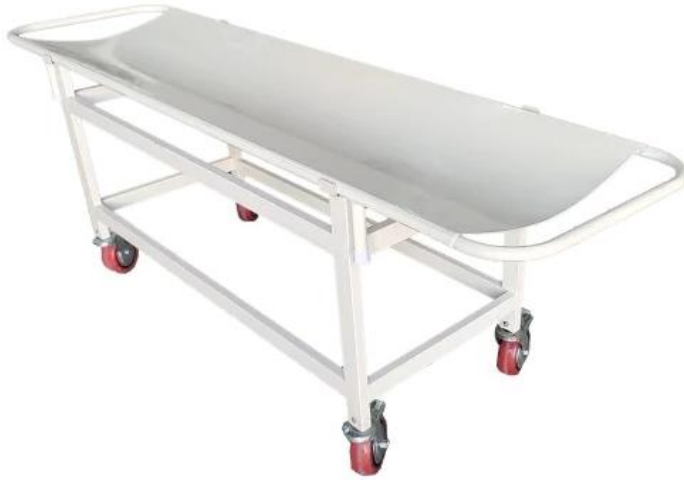
STRETCHER TROLLEY M.S. WITH SQUARE PIPE

LENGHT: - 48" WIDTH: - 22" HEIGHT: - 29"