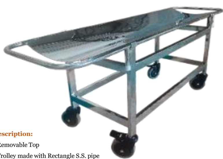
STRETCHER TROLLEY S.S WITH SQUARE PIPE

LENGHT: - 48" WIDTH: - 22" HEIGHT: - 29"