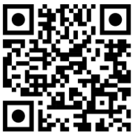
QR Project Images