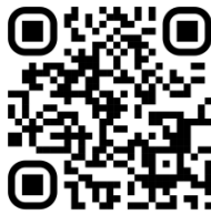
QR Contact Details